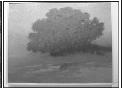
Love Bush 2000 oil on canvas 47" x 51" by artist Richard Mayhew.