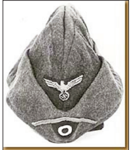
A German hat, along with explosives, were found in Amagansett