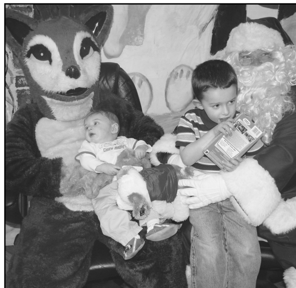
Santa with a club members grandson

December 11: Medford-Bald Hill, Brookhaven Women's, Great South Bay, Mid Brookhaven, West Lake, and Republican Clubs had a packed house at their Christmas/Chanukah party with Santa visiting and giving gifts to all those good boys and girls.