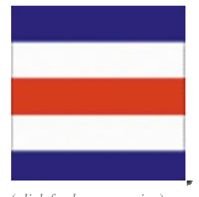
(click for larger version)

• Bumper - There is no such thing on a boat! See "Fender" in the weeks ahead!