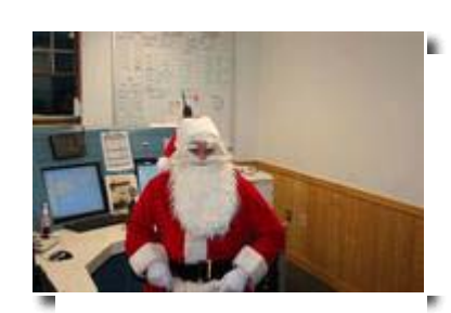
(click for larger version)

Just then from the White House came an urgent call, a crisis had arisen that would affect one and all.