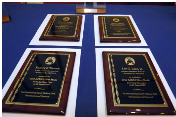
The AFRAS Silver Medal is presented annually to a deserving United States Coast

The crew had extensive knowledge of the local area and knew that the nearest red buoy was nearly one and a quarter miles southwest of them – directly into the oncoming waves.