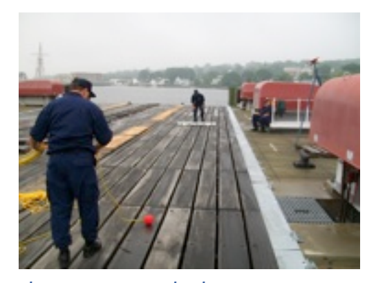
The Dream Team displays its winning ways at the regional competition in June.

Let's dish the dirt in the next newsletter. Rumors will not be published. Everything else will. Send to caseynyt@gmail.com