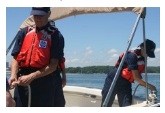
Training on "Seadog"