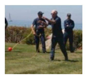
And then there was...training!

Thanks, George and Betsy: These pictures can't convey what a special day it was.