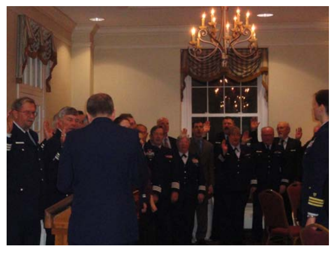
Administration of the oath to Auxiliary staff officers.