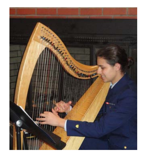
An Academy cadet plays beautiful music before dinner.