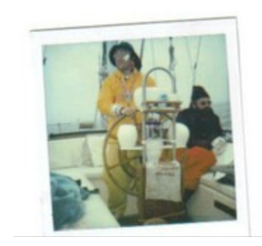
(click for larger version)

For information call Jim Mackin @ 631.324.2500