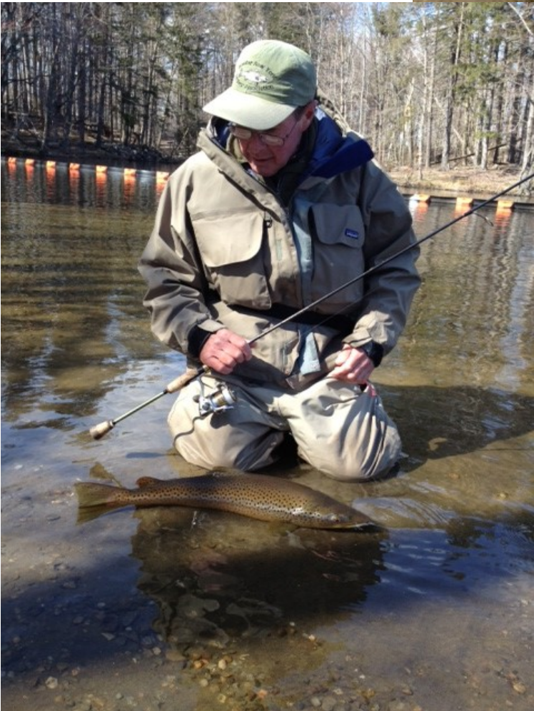
Big reservoir Brown