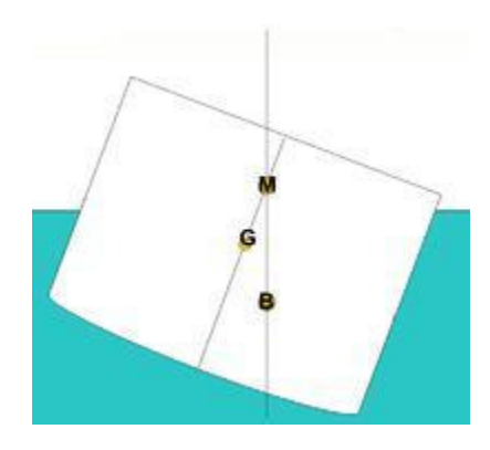
Diagram B

To understand the forces of a capsizing, and how those forces changes when you load the boat (<u>We All Get Heavier As We Age - And So Do Our Boats!</u>), let's get some terms under our belt. Most of us understand "center of gravity" (G) instinctually. But what is the center of buoyancy? The center of buoyancy (B) is the center of the volume of water which the hull displaces. When a ship is stable, the center of buoyancy is vertically in-line with the center of gravity of the ship. So, as long as the center of gravity (G), pushing the boat down, is above the center of buoyancy (B), pushing the boat up, we're good. How good? That is a very good question and as with many good questions, it requires more information to answer properly. Take a look at diagram A.